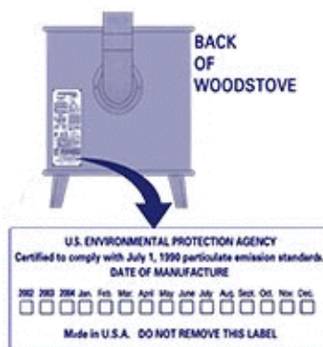
Permanent Wood Stove Label affixed to a stove